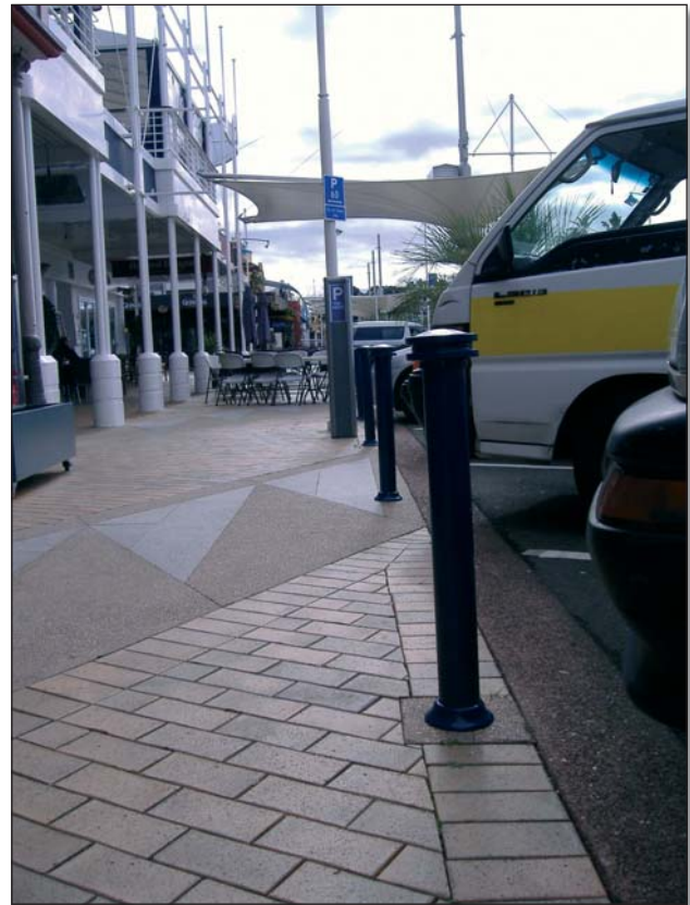
The Cache-50 was designed to re-use redundant coin operated parking meter posts.